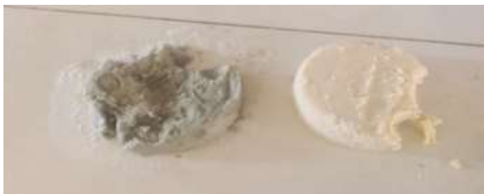
Figure 1: Soaps produced using different alkali: (a) palm bunch extracted alkali (b) pure potassium hydroxide alkali.

The more a soap's value for total fatty matter (TFM), the more its moisturizing and lubricating ability on dry skin. The higher the TFM content of a soap, the higher the soap's quality (Sarfaraz et al., 2019). A standard toilet soap gotten from a Nigerian shop has a TFM content of 75% minimum.